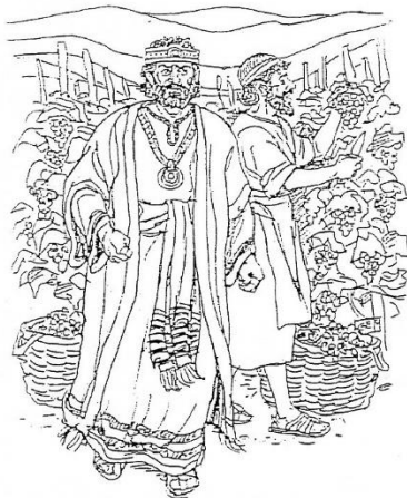
the king does not have a contented heart 1 Kings 21